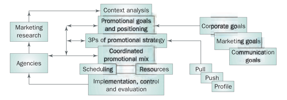
FIGURE 26.2 Marketing communications planning framework (MCPF)

Both SOSTAC and MCPF incorporate broader business and marketing factors than simply those that focus directly on the organisation of communications activities. This breadth provides a basis for integration at a higher marketing planning level. A starting point which examines the current situation (S) or context needs to look at the overall business and competitive position of the firm, develop an understanding of consumer behaviour, review all relevant internal and external factors and identify the communication needs of all stakeholders, not just those of customers. From this analysis, communications objectives (O) can be set in relation to business and marketing objectives. In the MCPF, this stage will involve consideration of positioning factors. Communications strategies (S) may take